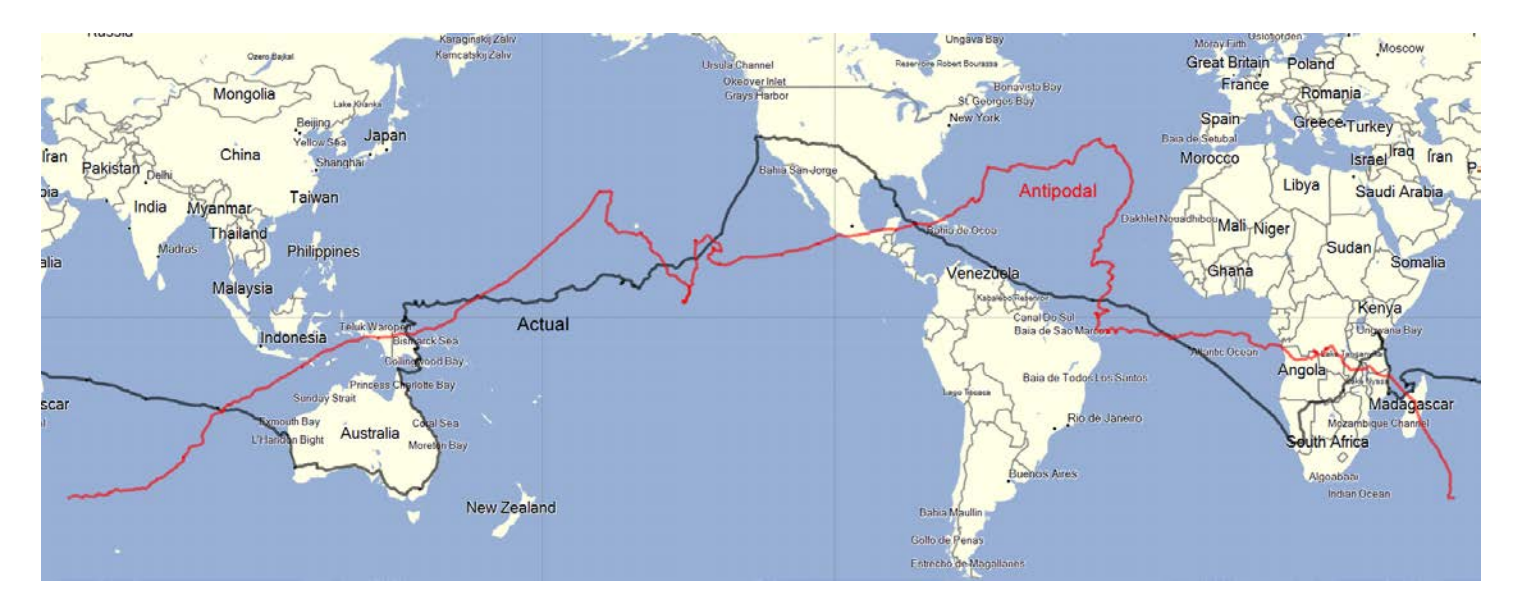
The antipodal track of the human powered circumnavigation in red

A sine qua non requirement of Erden's human powered circumnavigation was to include a pair of antipodal points on his route. He achieved this requirement for the first time near Cap St Andre of Madagascar. Antipodes are pairs of points on the earth's surface which are located diametrically opposite of each other, like the North Pole and the South Pole. Every point has its antipode.