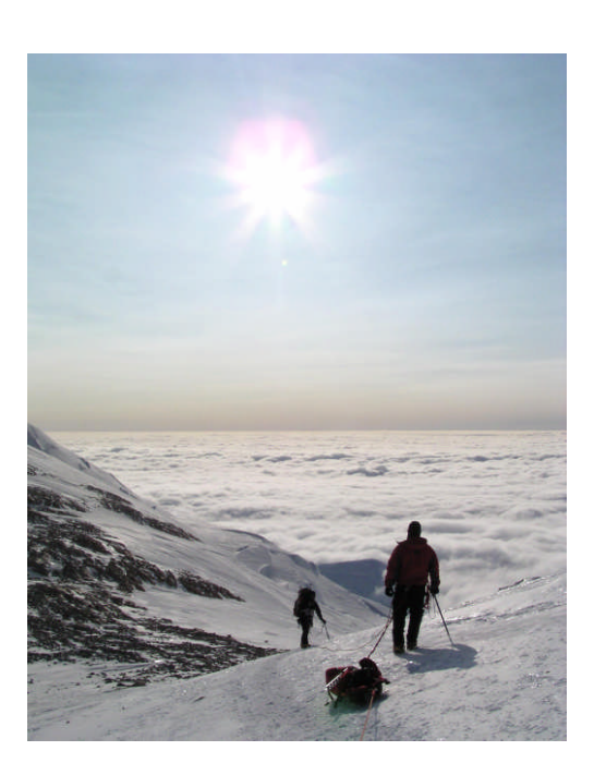
Gazing over a field of clouds from Windy Corner during the ascent of Denali