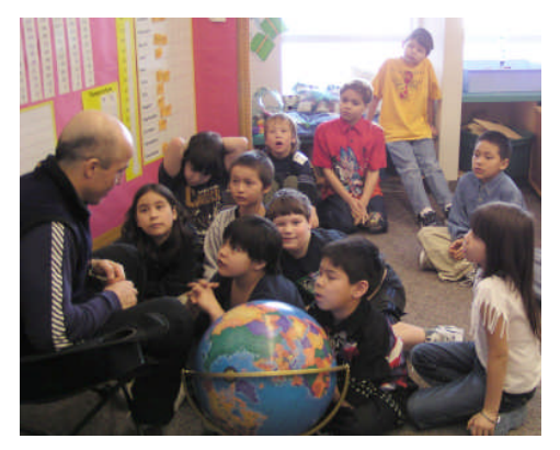
With students of the Chalo School at Fort Nelson First Nation, BC.